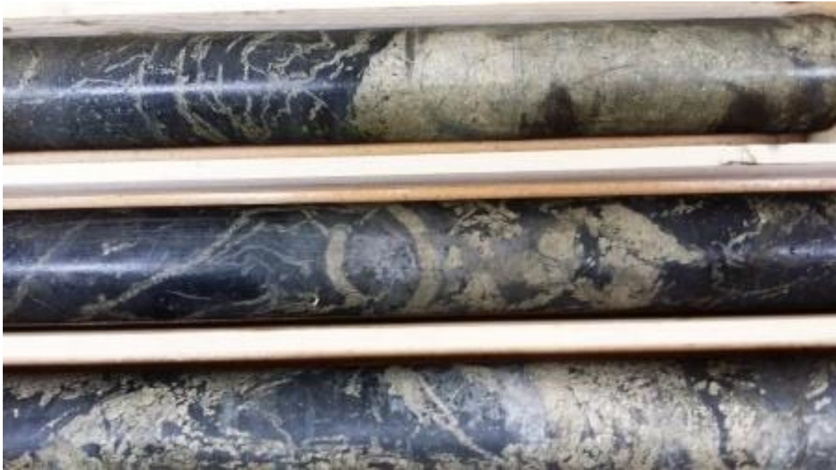
Plate 2: Example of SMP 1