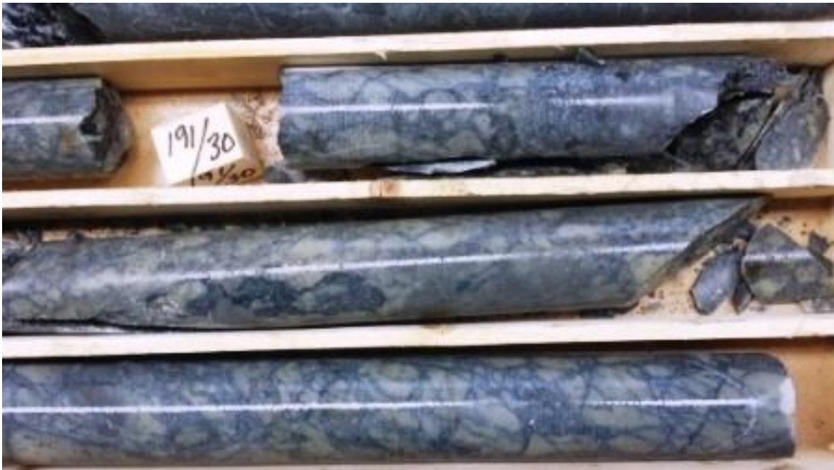
Plate 1: Example of Phyllic 1