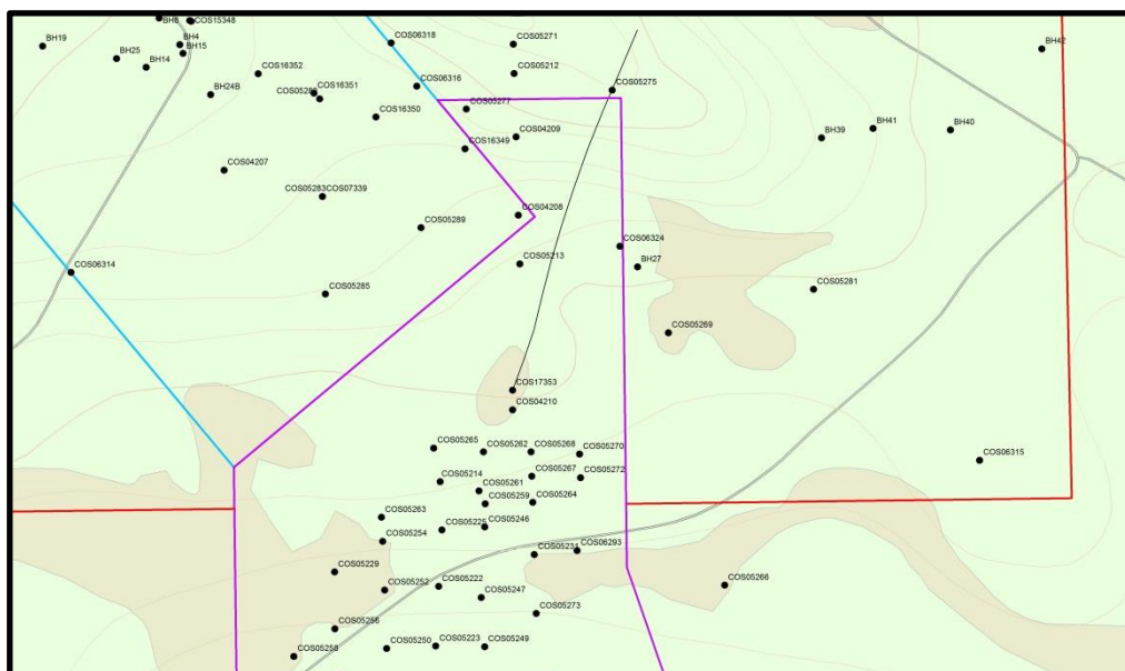
Figure 1: Location and trace of COS17353

Detailed 3D modelling and vector analysis of these data sets combined to form a basis for design of a deep core drill programme to test this hypothesis. The programme includes three steeply dipping boreholes each to a minimum of 800 m length at Svartliden. Drilling of the first borehole (COS17353) commenced on 03rd February 2017 and is being drilled by Styrod Drilling AB. The chosen collar lies south of Svartliden (see plan view on Figure 1 below) and was aimed northwards (on azimuth 020) and drilled at an angle of -70 degrees from horizontal. Downhole giro survey on the 14 th March 2017 when the drillhole length was approximately 700m showed a very slight deflection to the east and reduction in dip angle to approximately -62 degrees (see basic section on Figure 2 below).