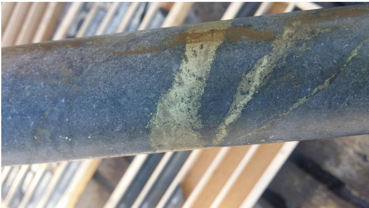
Plate 5: Example of MMZ showing veins of chalcopyrite pyrite and fine bornite