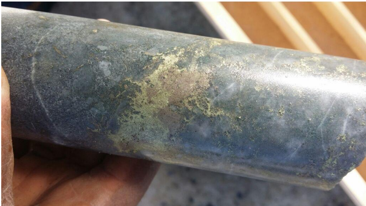
Plate 3: Example of MMZ showing intergrown bornite and chalcopyrite within highly altered core