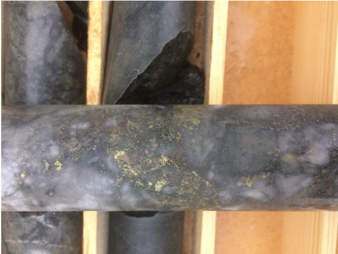
Plate 4: Example of MMZ showing intergrown bornite and chalcopyrite within highly altered core