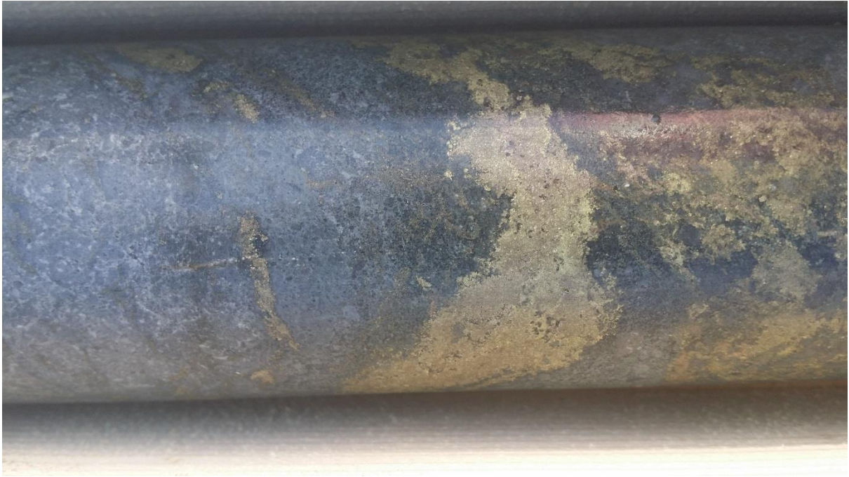
Plate 6: Example of MMZ showing chalcopyrite, bornite and minor pyrite